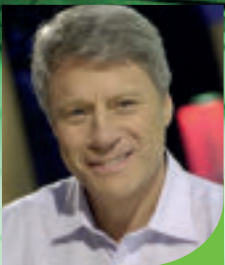
Nick Ross Broadcaster and Moderator of the HC Conference

For informaticians, clinicians and senior managers across health and social care